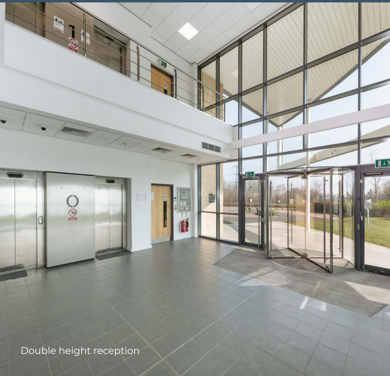
Double height reception