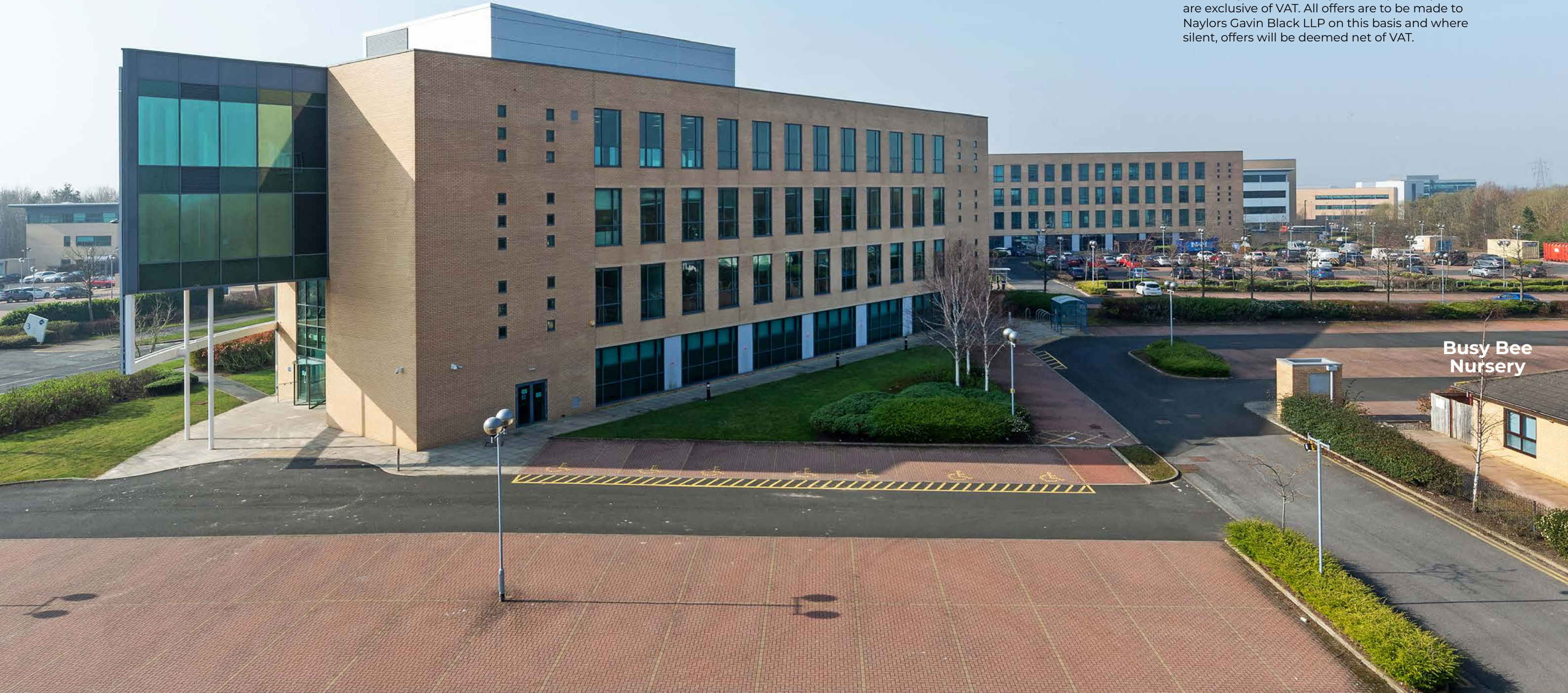
Busy Bee Nursery

All rents, premiums and purchase prices quoted are exclusive of VAT. All offers are to be made to Naylor's Gavin Black LLP on this basis and where silent, offers will be deemed net of VAT.